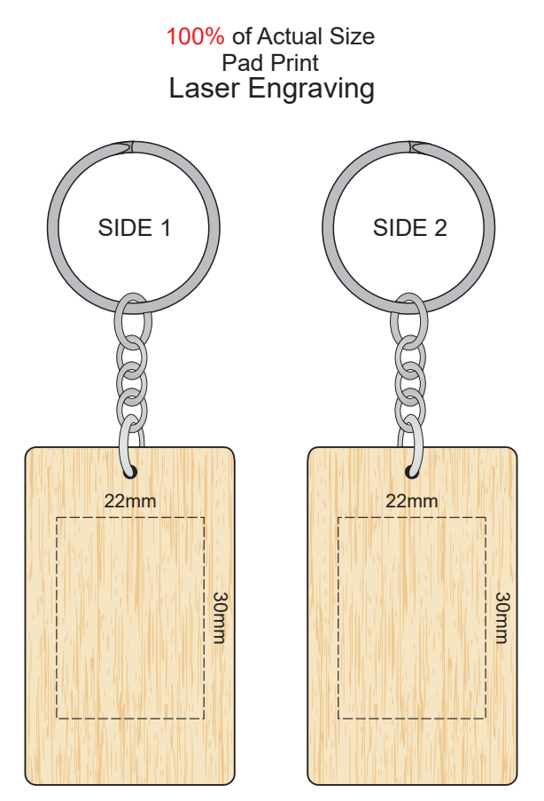
This product is a natural material, please allow for variances in grain pattern and branding.